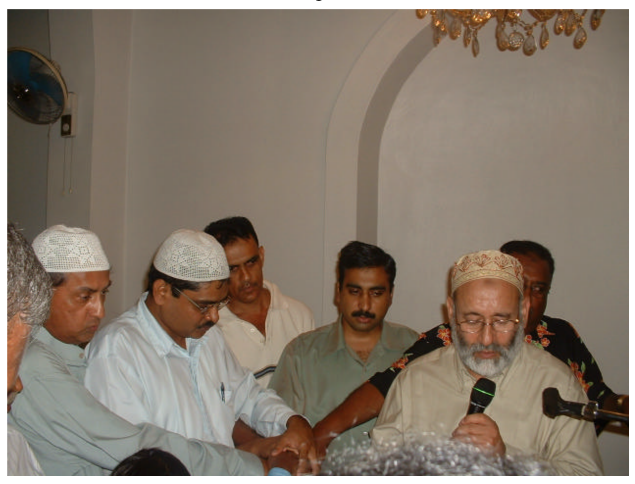
Bai'at at Masjid Noor, Suva