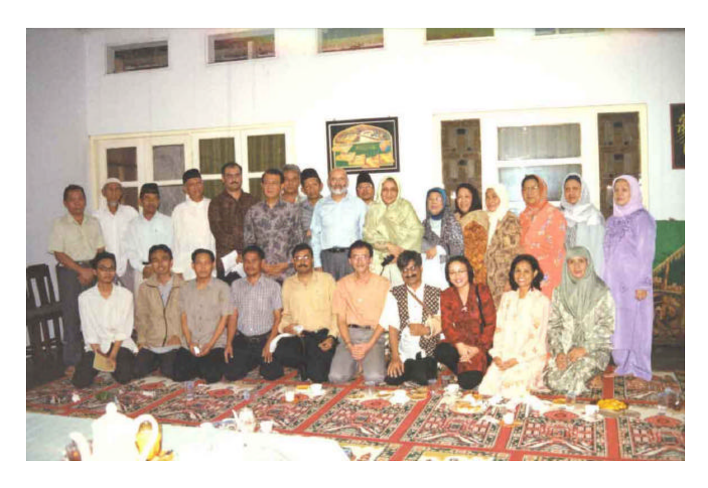
A gathering at the Jakarta Mosque