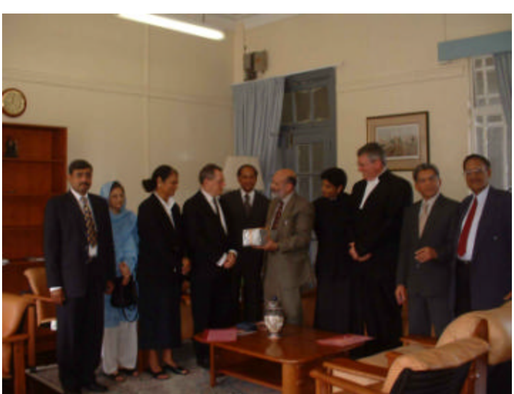
With Judges of the Fiji High Court