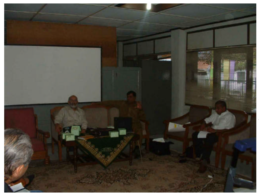
With the New Zealand members