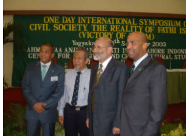
With Head of the Islamic & Cultural Studies