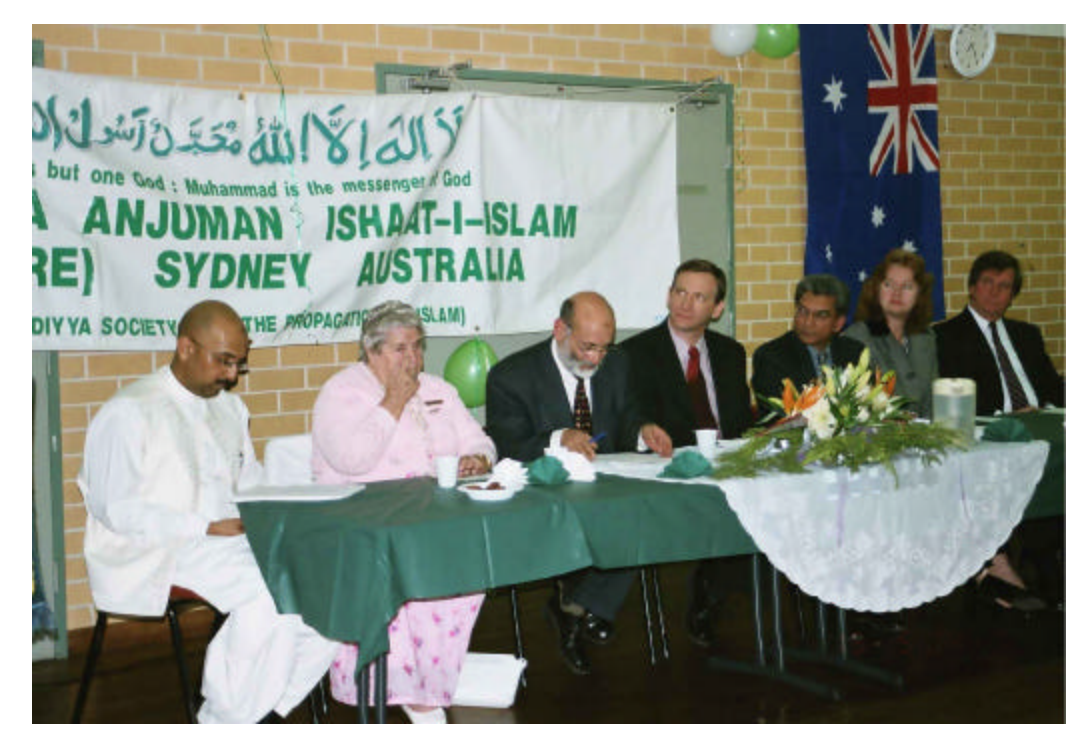
With Senior Elder of Dharruk Tribe, Mayor of Blacktown, Councillors and President of Sydney Jama'at