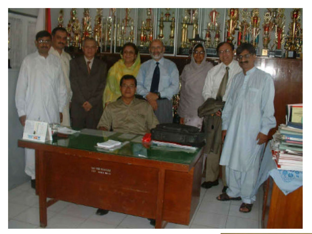
With the Principal of the Ahmadiyya Schools of Piri Group