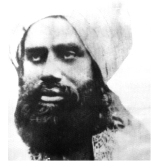
Hazrat Maulana Hakeem Nur ud Deen, the First Successor of Hazrat Mirza Ghulam Ahmad Sahib of Qadian

You can also download this newsletter from http://www.aaiil.org/ilan