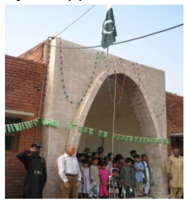
Independence Day of Pakistan was celebrated on 14<sup>th</sup> August 2004. A simple