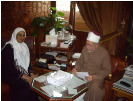
The Late Sheikh Tantawi, Head of Al Azhar University, Cairo, signing the foreword he wrote to the book 'The Religion of Islam' by Maulana Muhammad Ali of the Lahore Ahmadiyya Movement.

bookstores in the US, and many universities use them as text books. But what we also do is have these books translated into different languages and placed into the hands of native populations around the world, so that people have an opportunity to learn about their religion for themselves and not rely on some politically-motivated cleric telling them what their religion is about.