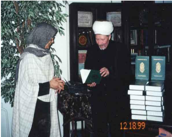
Thousands of copies of the Holy Quran delivered free to Russia and Asia

work that requires international travel done before the next election, perchance a certain celebrity becomes president and I may not be allowed back into the country ... [laughter]. But in all seriousness, all of this work to counter these extremist ideologies and combat the very foundation of the terrorists' propaganda is being done by American Muslims, many of whom