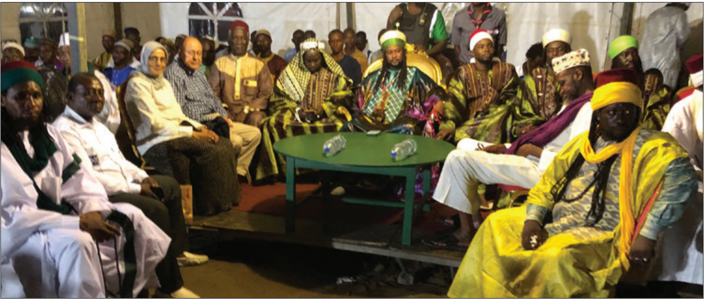
View of the guests in Pavillion