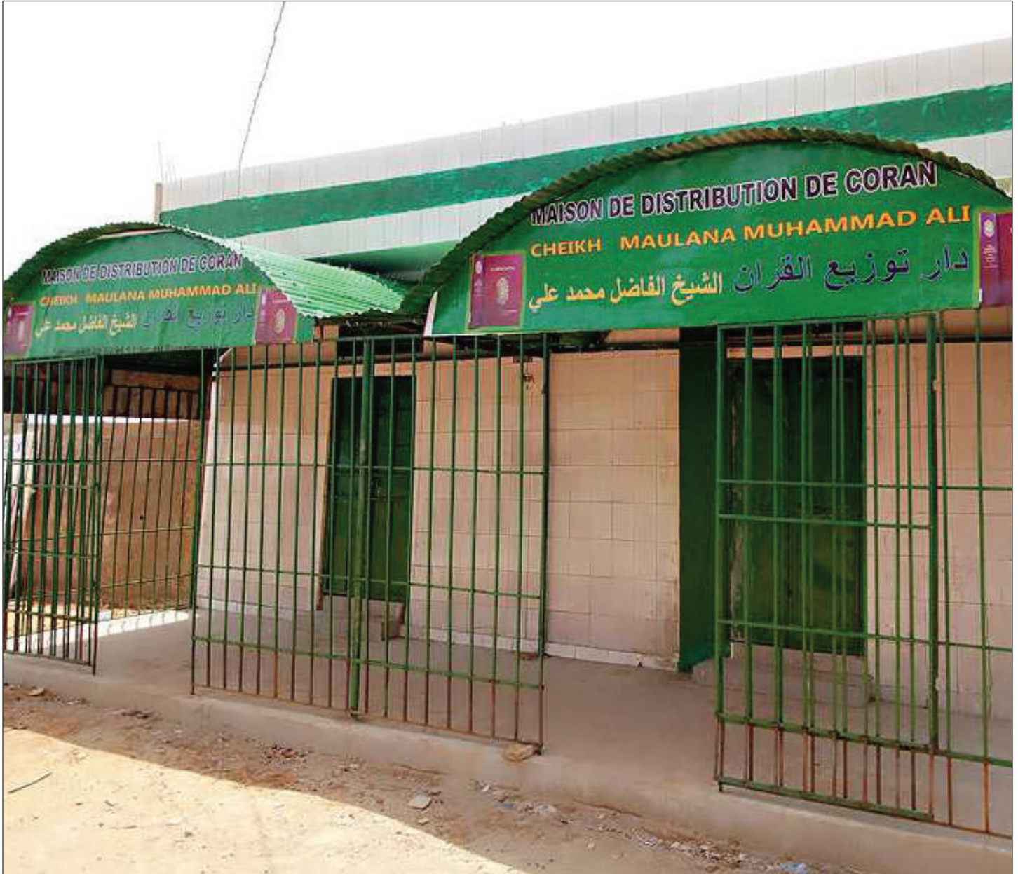
Maulana Muhammad Ali Quran Distribution Center