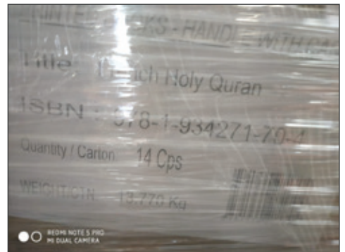
Pallets in Printing Press ready for shipment