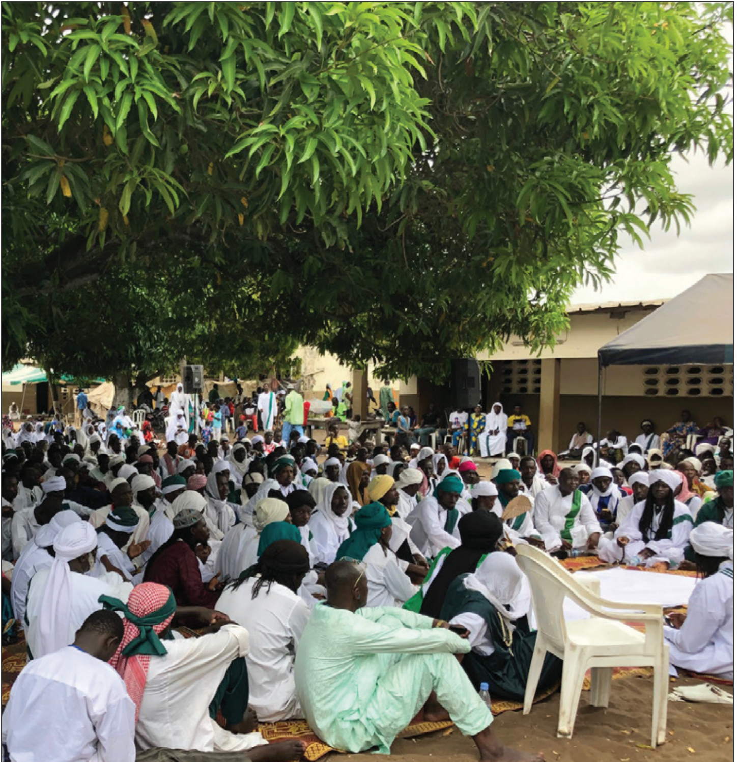
Jumma Prayers in Schoolyard prior to Jalsa

about Peace in Islam. It was a joy to perform the Jumma prayers with people who have a very tolerant and peaceful Islamic viewpoint and show so much appreciation for Maulana Muhammad Ali's French Holy Quran translation and Religion of Islam.