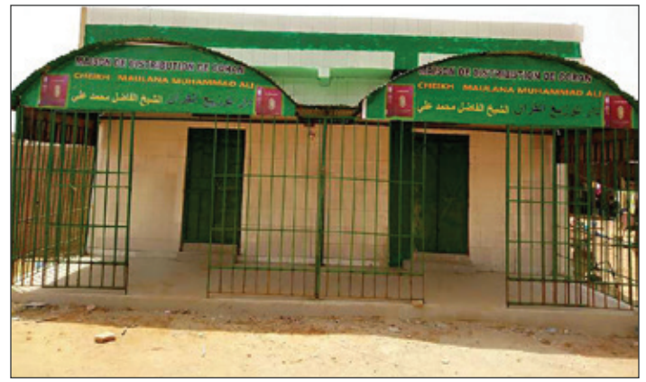
Maulana Muhammad Ali Quran Distribution Center