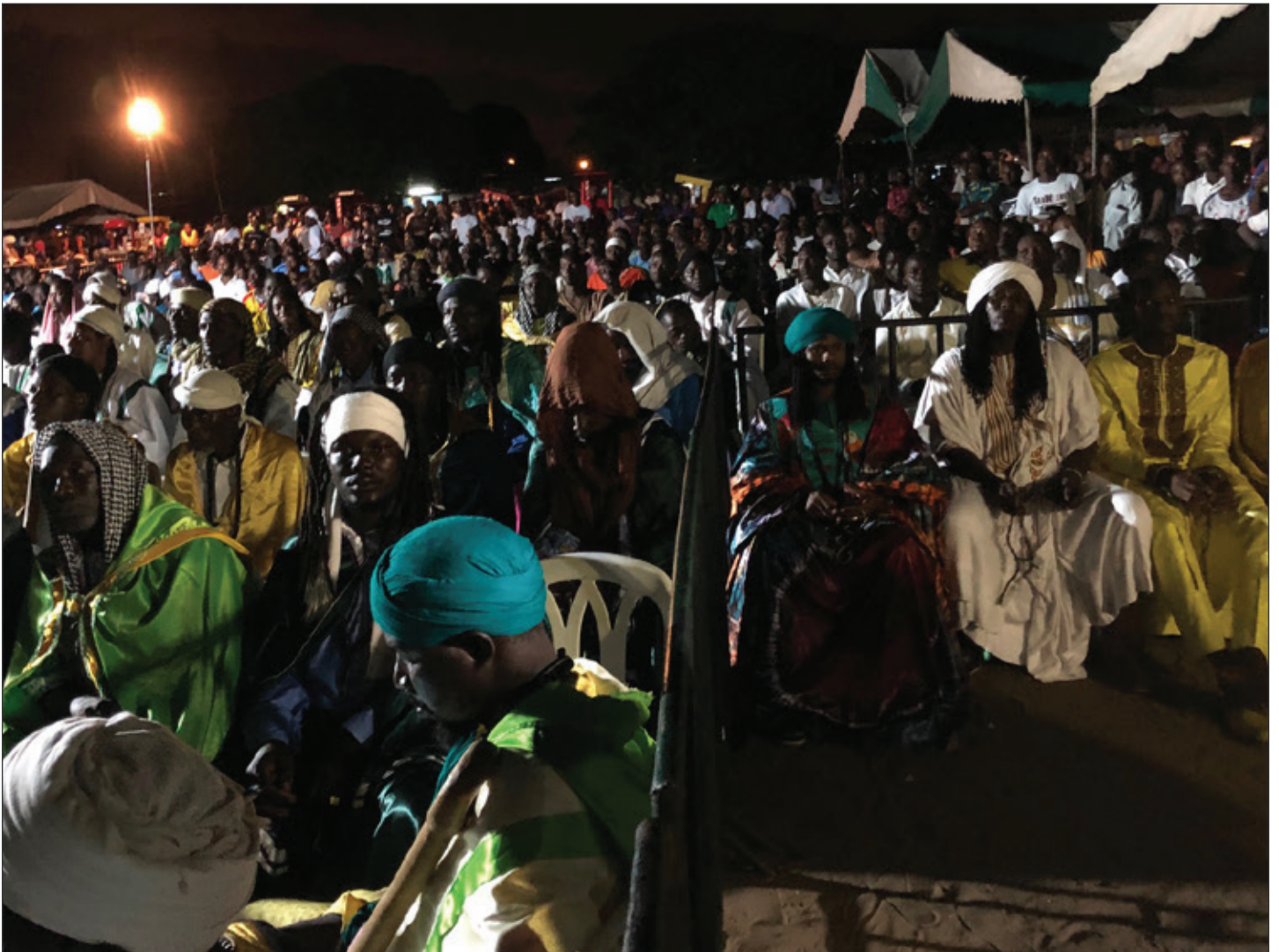
View of Jalsa Audience