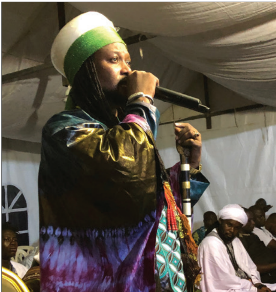
Sufi Cheikh Konato addressing the audience