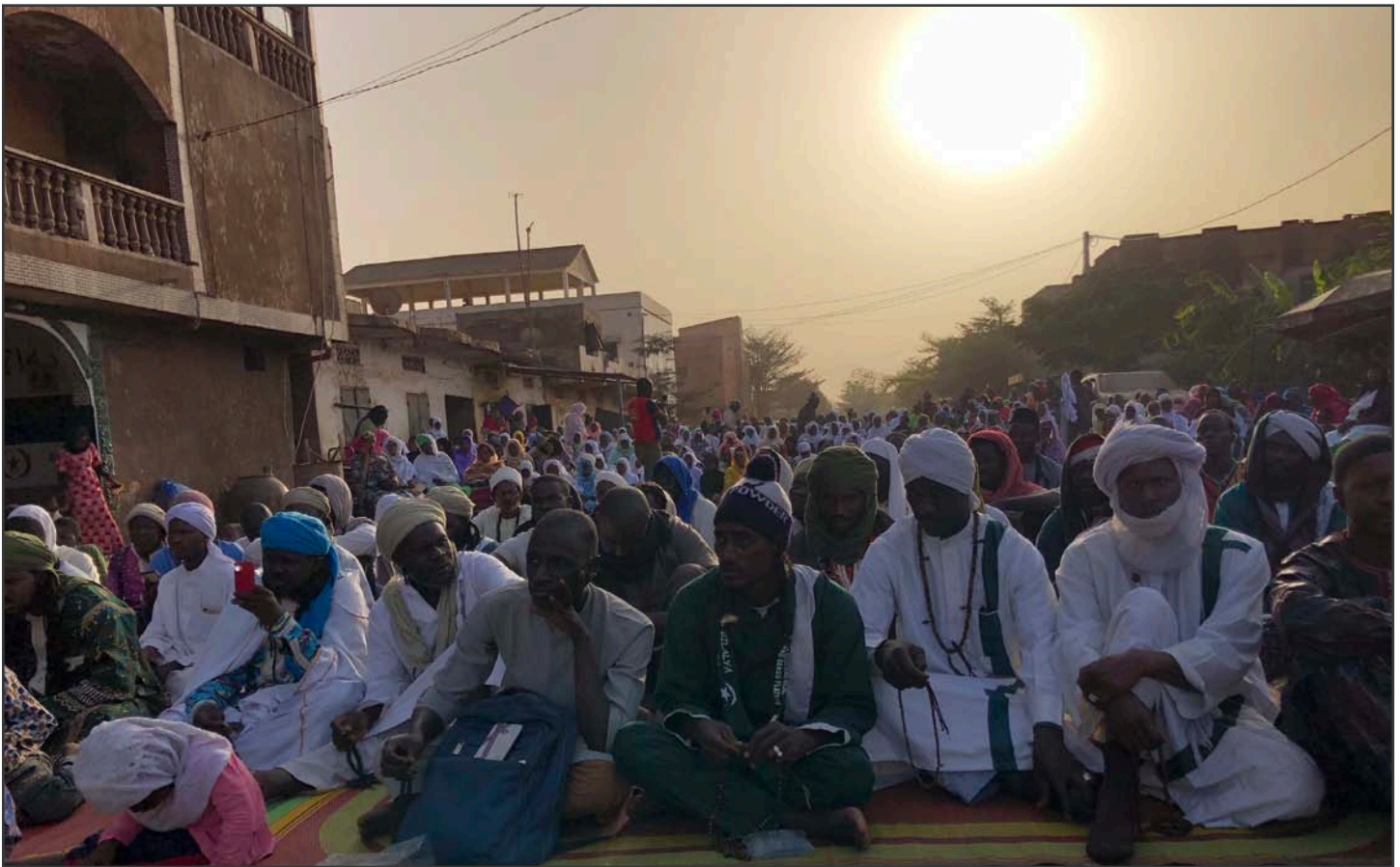
Getting ready for prayer at the French Holy Quran opening Jalsa