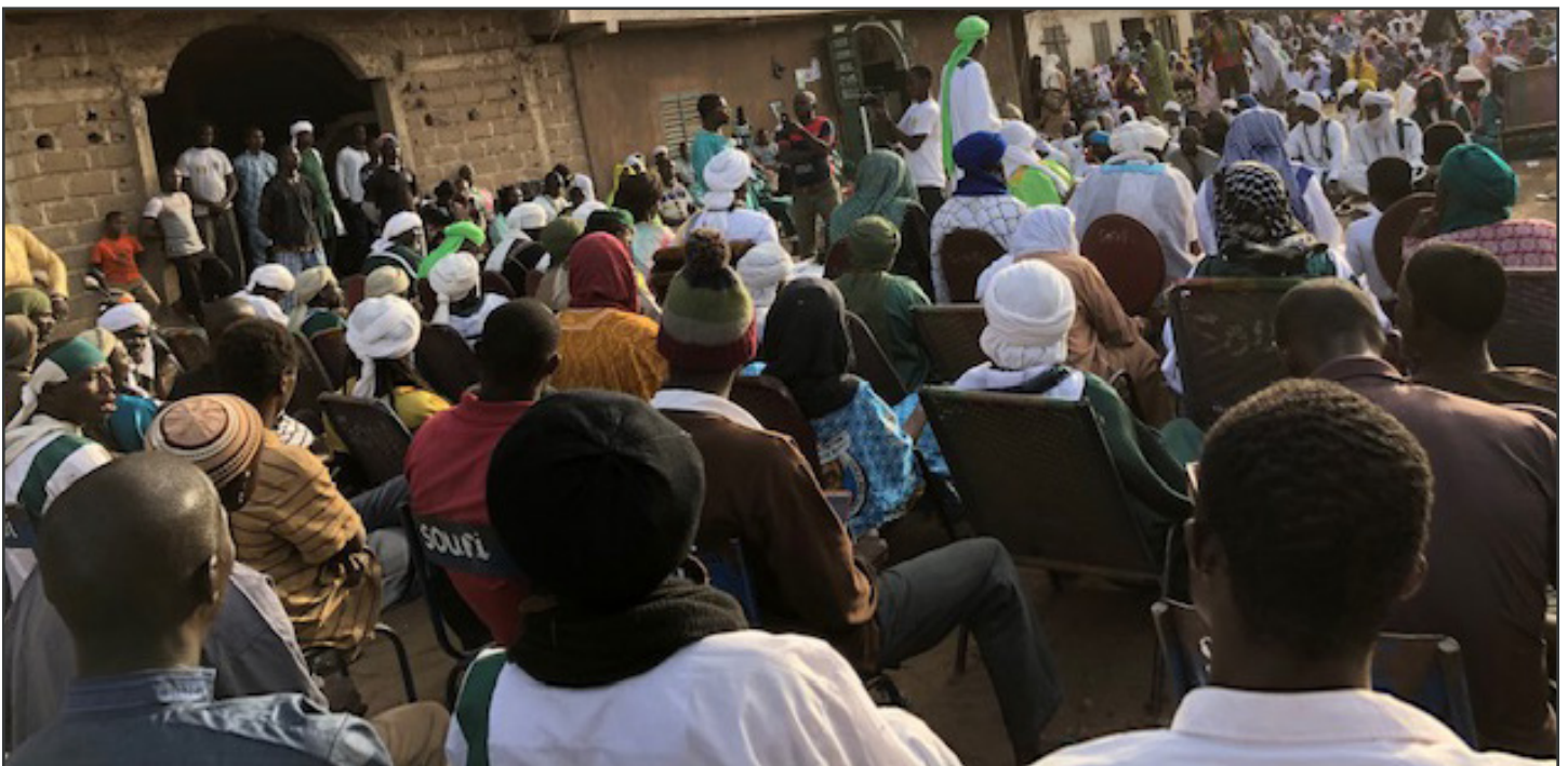
Jalsa audience on Friday