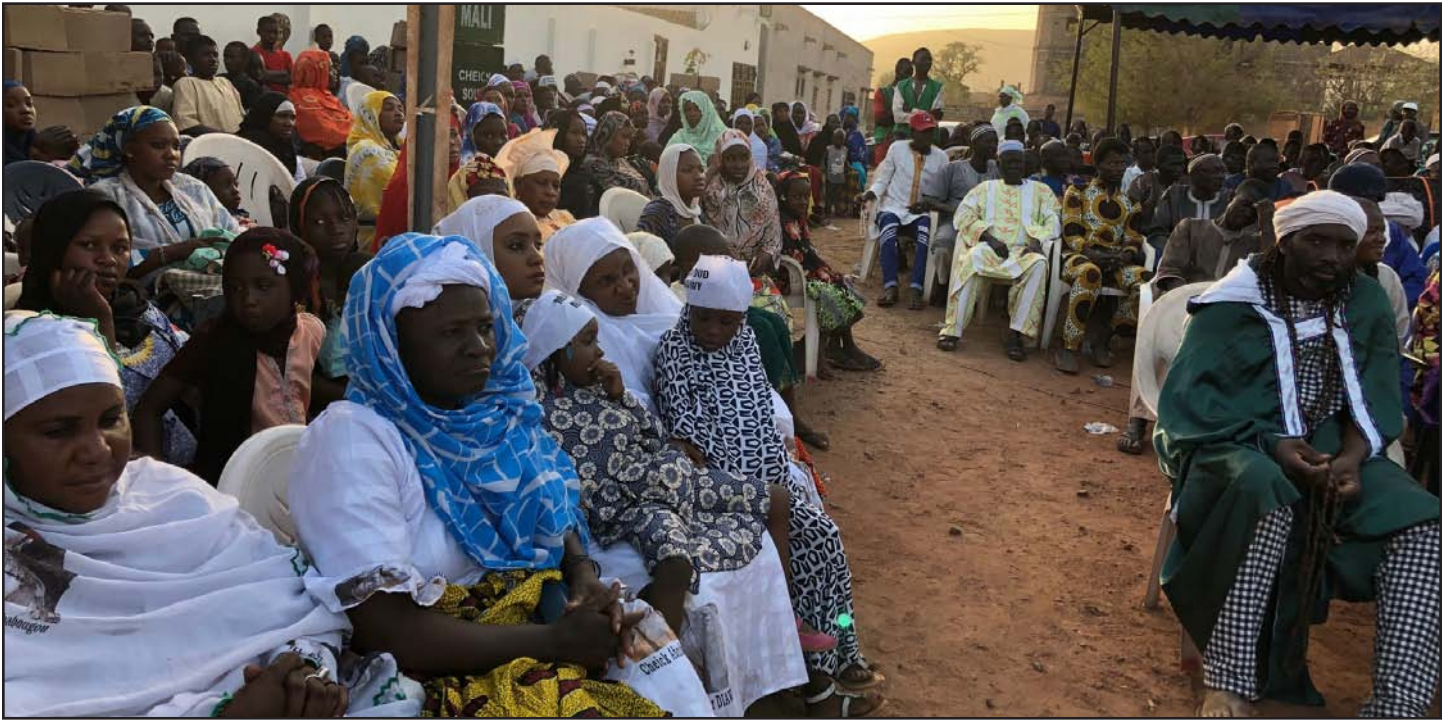
partial view of the audience

I was asked to deliver a talk and a closing dua . I gave a short talk about our organization's work and expressed our heartfelt thanks for their hospitality and their appreciation for Maulana Muhammad Ali's French translation of the Holy Quran and The Religion of Islam and reiterated our commitment to supply them with our literature.