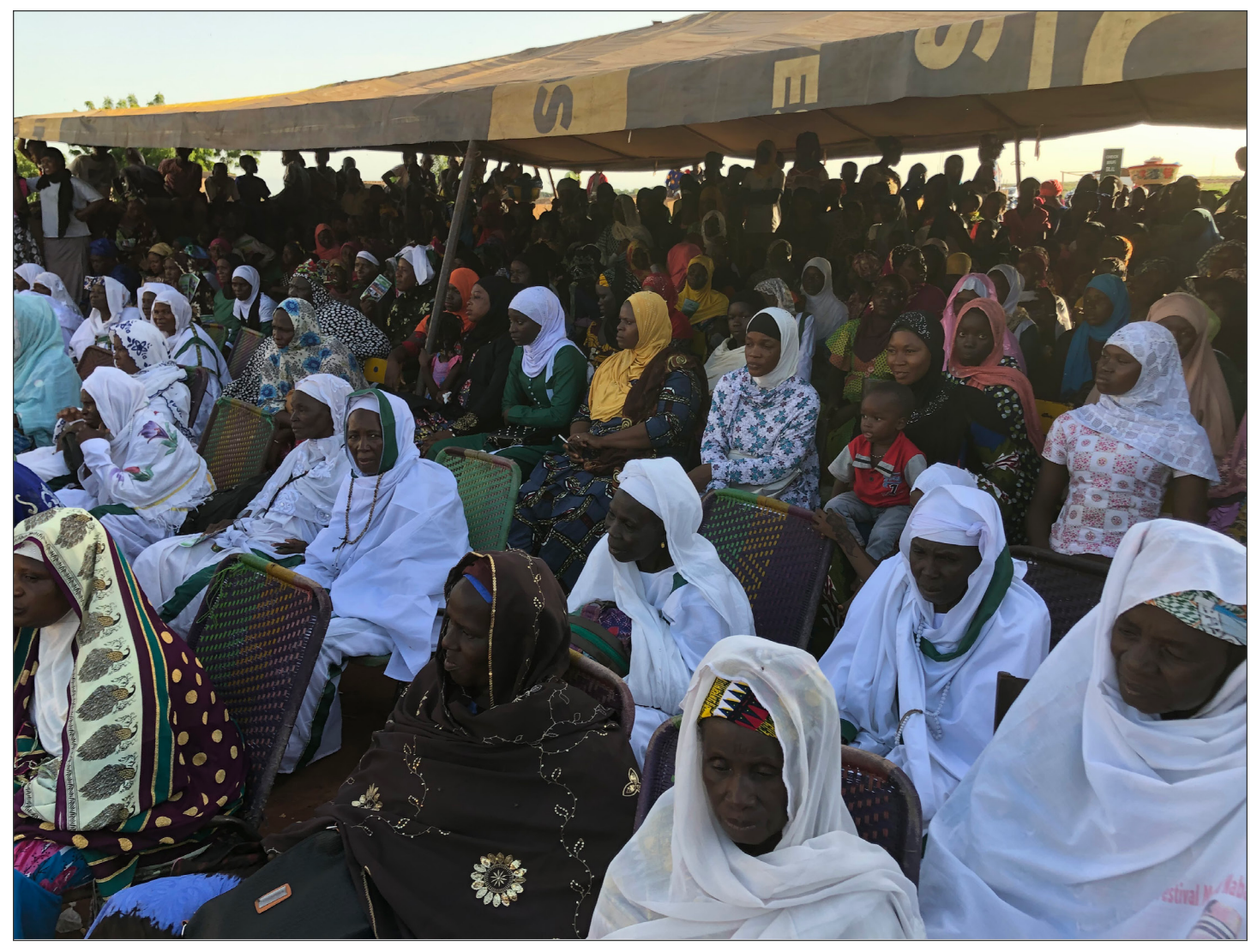
Ladies section of the audience