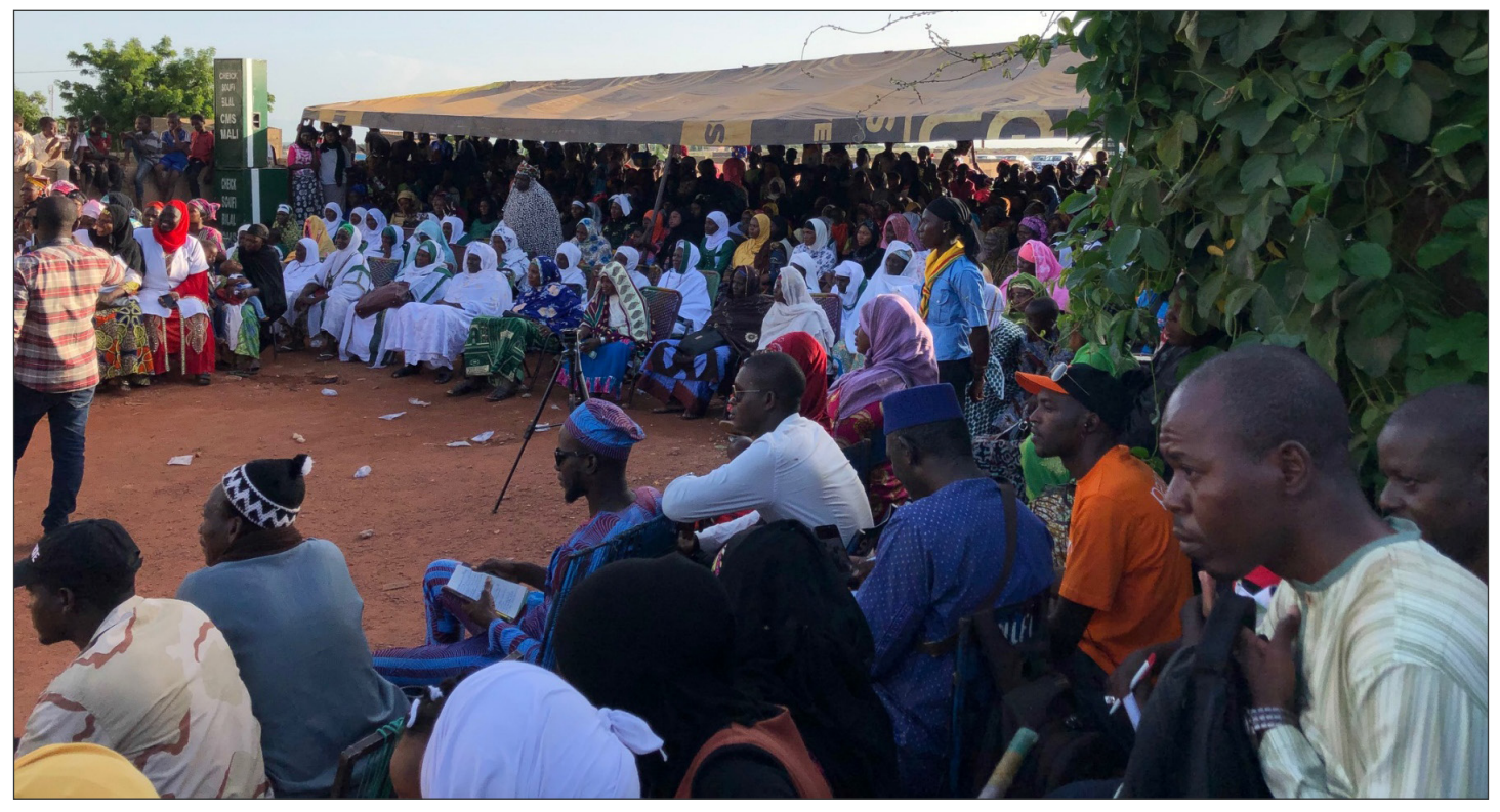
Audience at MM Ali Quran Distribution Center Opening