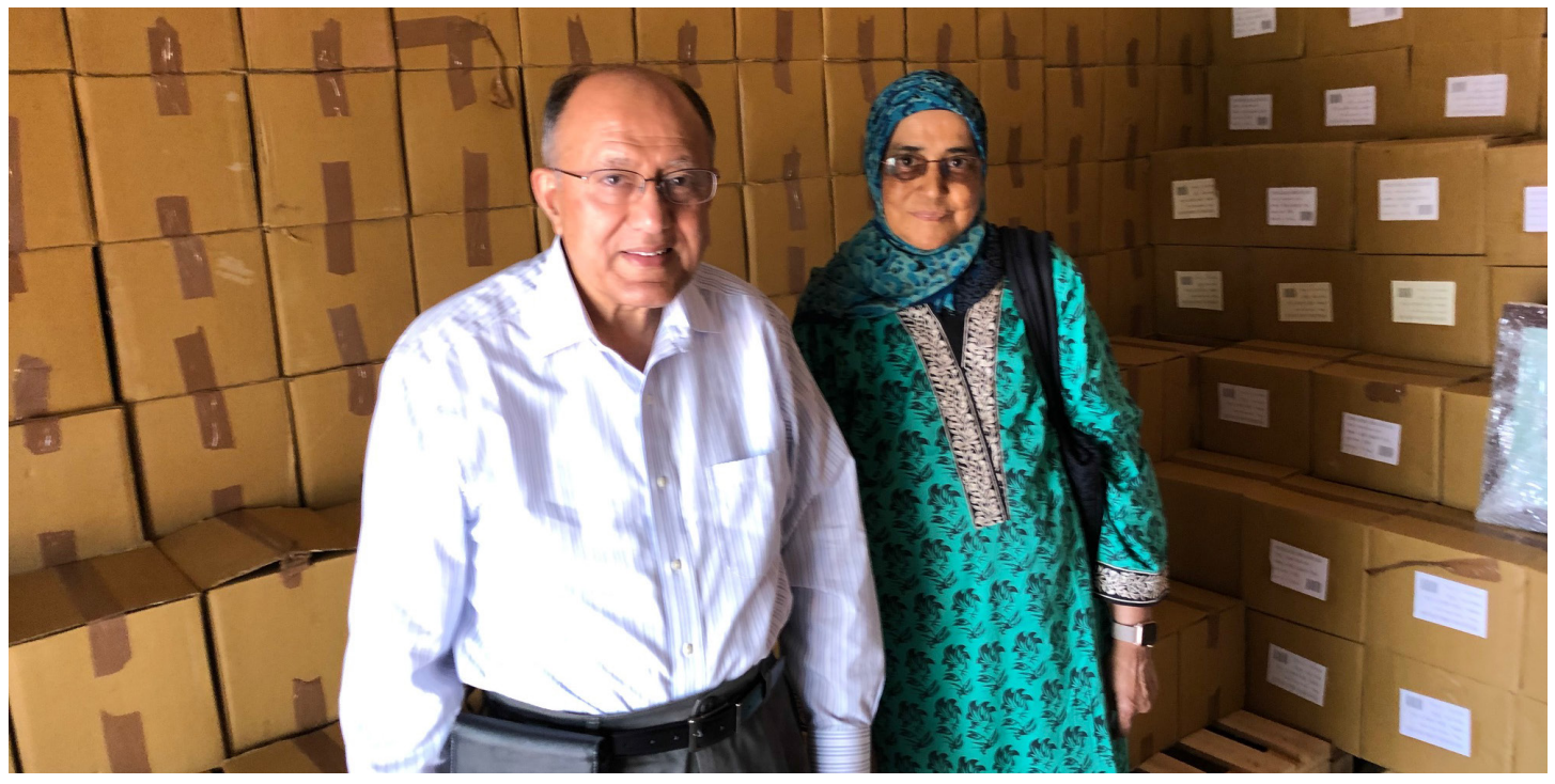
French Holy Quran stored in the MM Ali Quran Distribution Center