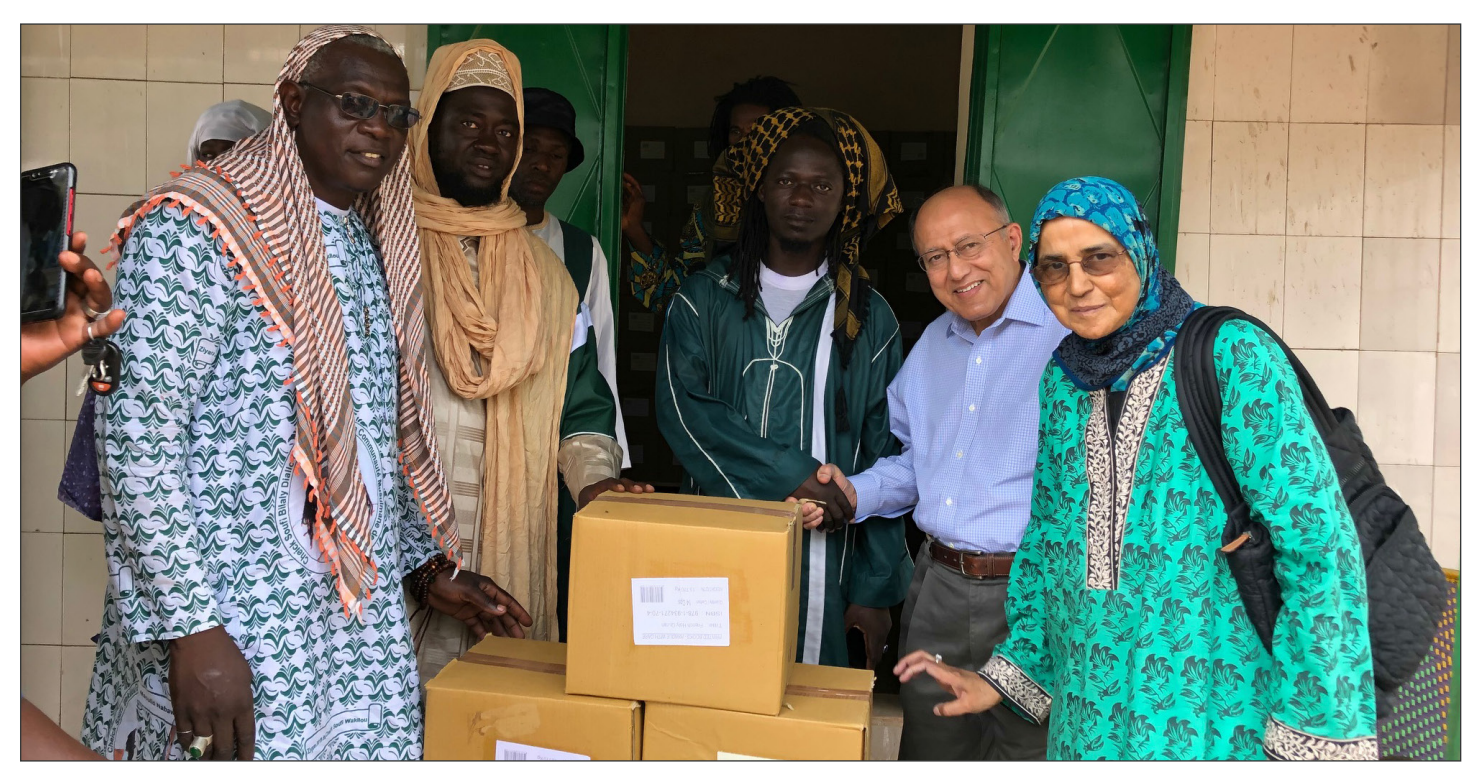
Sufi delegation from outside Bamako collecting their share of the French Holy Quran from the MMAli Quran Distribution Center