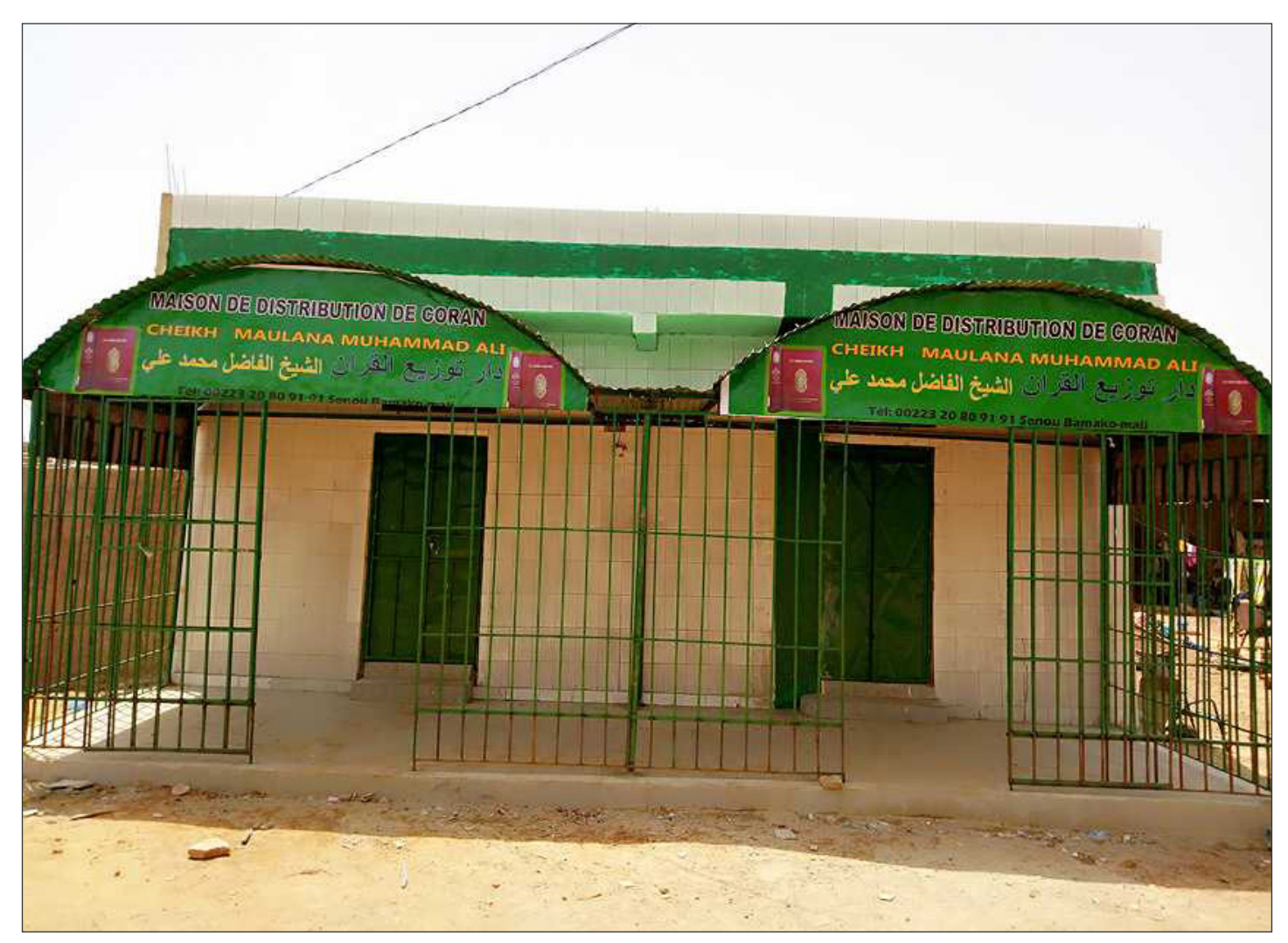
Maulana Muhammad Ali French Holy Quran Distribution Center

Ali French Holy Quran Distribution Center was officially opened in Mali, West Africa on July 27, 2019.