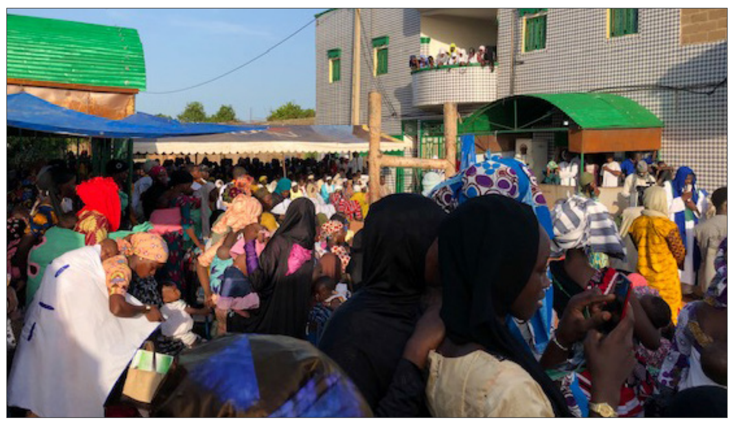
View of Audience at the opening of MM Ali Center