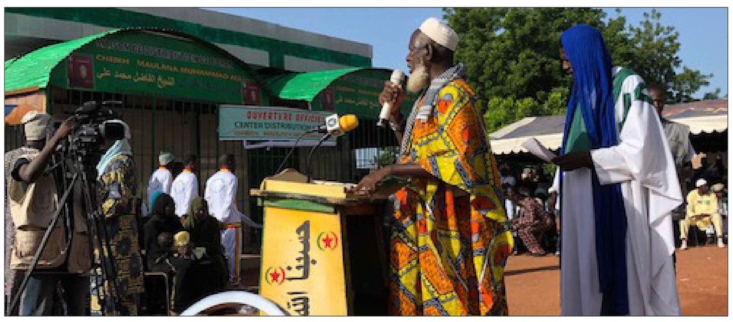
Dignitary Giving a Speech at the Opening of the Center