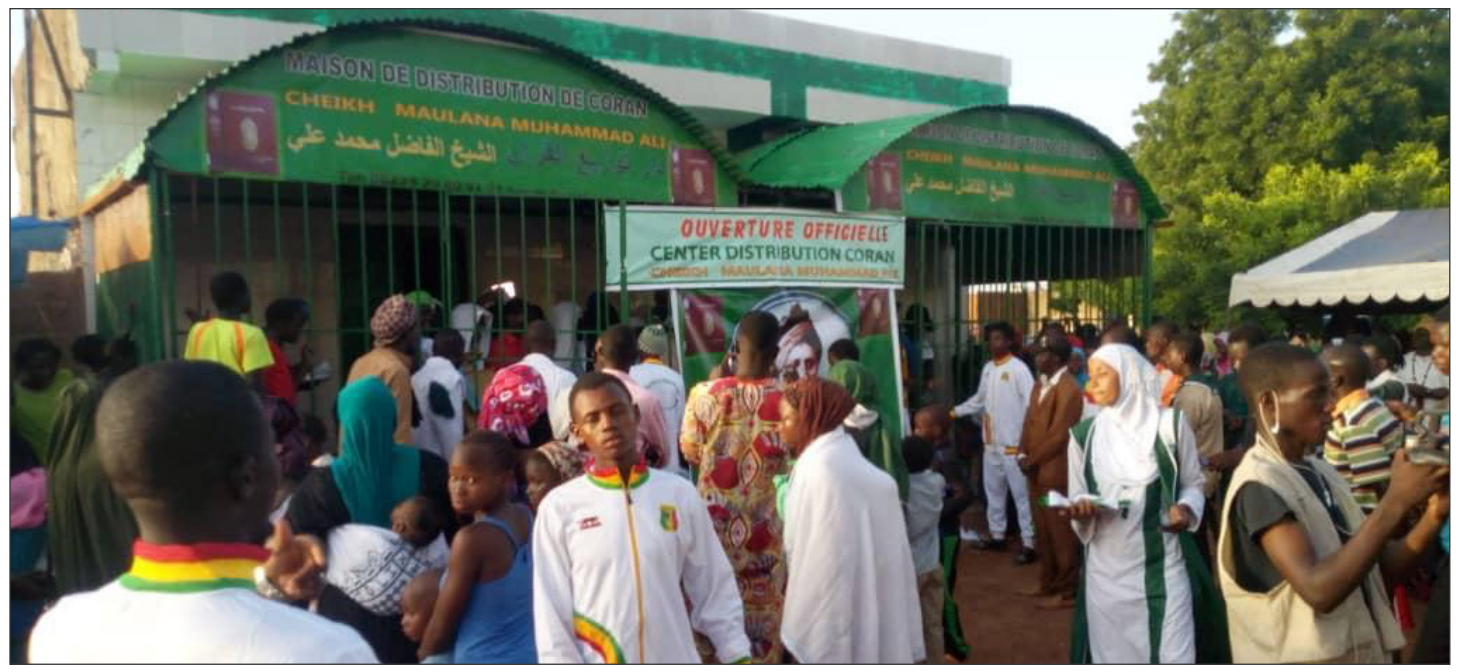
View of Audience in front of the Quran Distribution Center