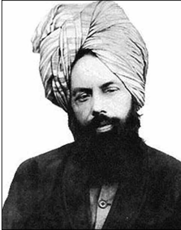
Hazrat Mirza Ghulam Ahmad (d. May 26, 1908)

Mujadid of the 14th Century Hijra, Mahdi, Promised Messiah and Founder of the Ahmadiyya Movement in Islam