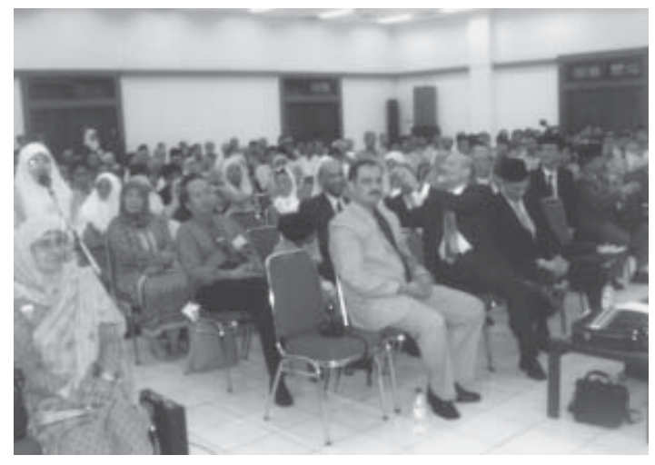
Gathering at the Symposium - view of the audience attending the Symposium