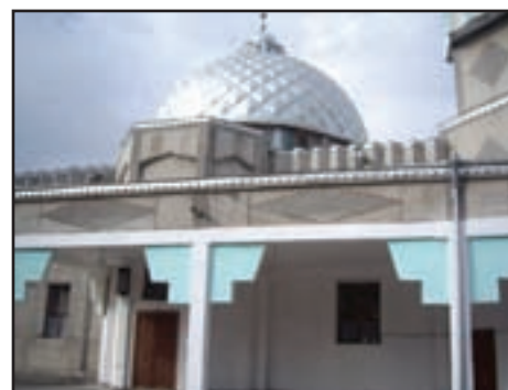
Front of the main Mosque of Bishkek, Kyrgyzstan