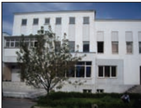
Television Station of Bishkek Kyrgyzstan