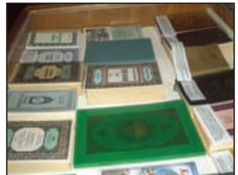
Holy Quran translation in different Languages in the Library of Tashkent Uzbekistan

belong to. Then they asked me to write it all down in English for the Rector as he knew English, and he would decide if he wanted to meet with me after reading my report.