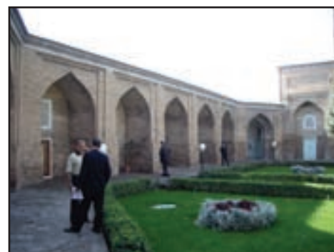
Side View of the Office complex of the Mufti of Uzbekistan