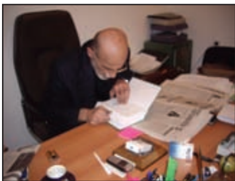
Vice Sheikh ul-Islam looking at the Russian Holy Quran