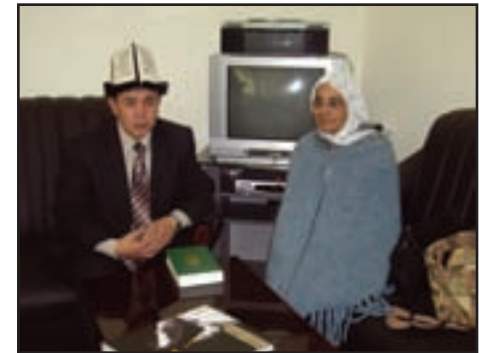
Rector of the University of Islamic Studies in Bishkek Kyrgyzstan