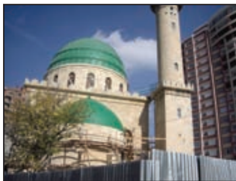
The main Mosque of Baku, Azerbaijan