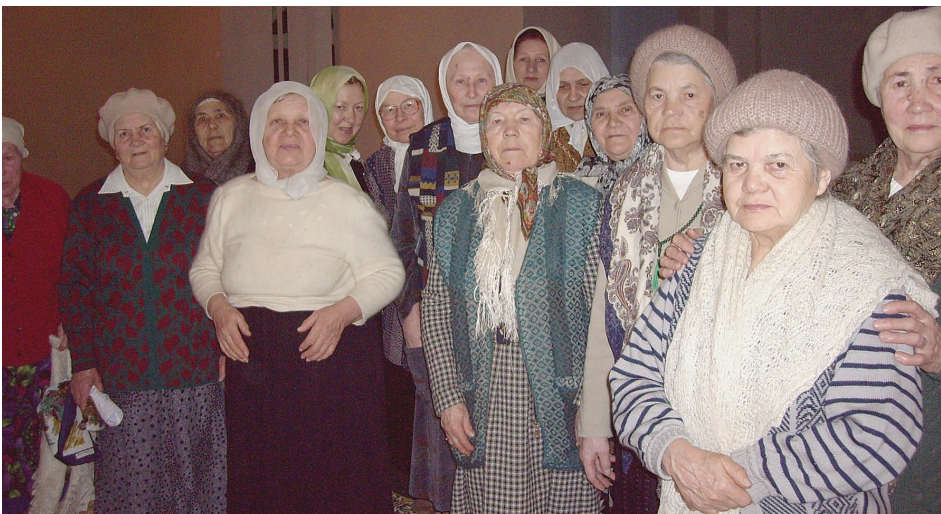
Russian Muslim women attending Jumma Prayers at the Hilal Foundation Mosque in Moscow.

Hazrat Mirza Sahib has prophesized that his followers in Russia would be as numerous as the grains of sand in the desert. We do not know whether this prophecy will be fulfilled in our lifetimes or not, but we do know that an essential prerequisite for its fulfillment is that knowledge of the Holy Quran inspired by the Promised Messiah and Mahdi should reach the Russian people. It cannot be over emphasized, that this is the right time to introduce our literature into Russia and the Central Asian Republics. The majority of religious leaders and public are not prejudiced against the Lahore Ahmadyya Movement, and people are thirsty for Islamic knowledge. Once they are exposed to the God inspired and enlightend literature of Hazrat Mirza Ghulam Ahmad and Maulana Muhammad Ali, the demand for it, Inshallah, is bound to increase.