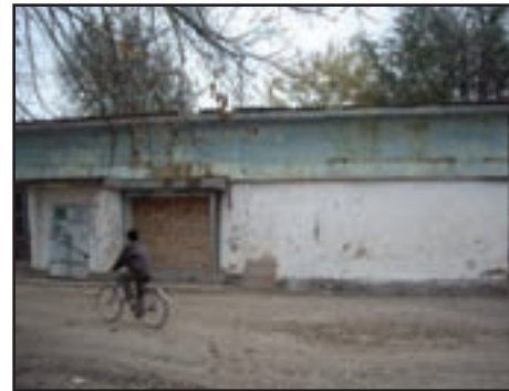
Front view of the old building being purchased for the mosque in Beshkek Kyrgyzstan