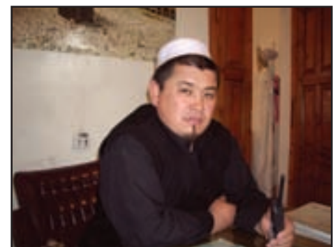
Imam of the Bishkek Mosque in Kyrgyzstan