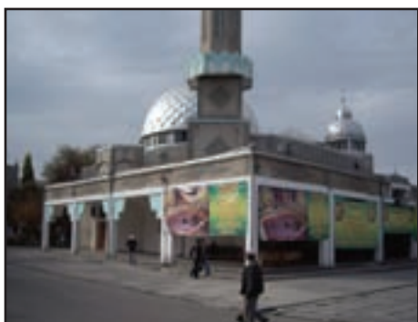
Main Mosque of Bishkek, Kyrgyzstan