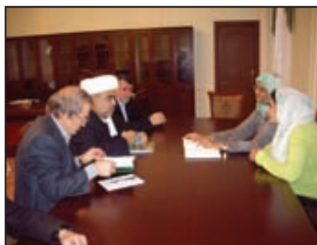
Sheikh-ul-Islam Prof. Dr. Allahshukur Pashazadeh reading the review of the Sheikh Dr. Tantawi's review in Arabic Religion of Islam