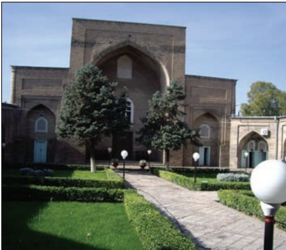
Office Complex of the Grand Mufti of Uzbekistan