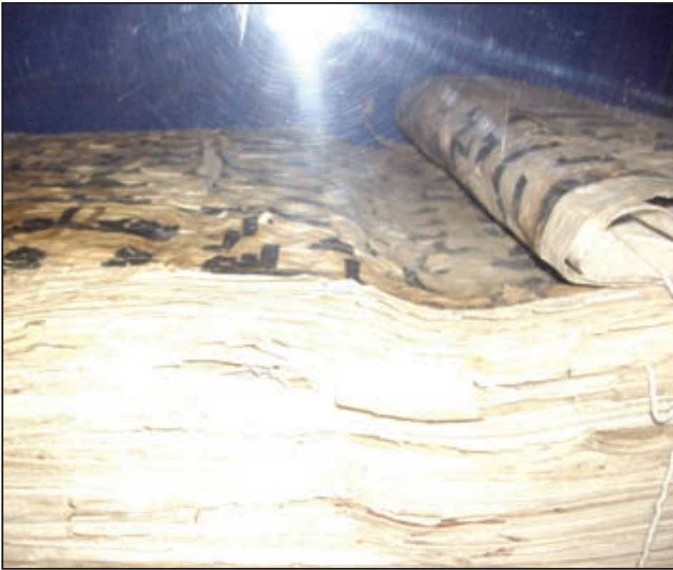
One of the original copies of the Holy Quran made by Hazrat Usman in Tashkent Uzbekistan