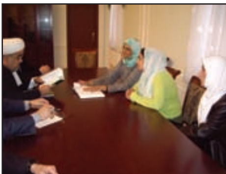
Sheikh-ul-Islam Prof. Dr. Allahshukur Pashazadeh reading the verses of the Russian Holy Quran