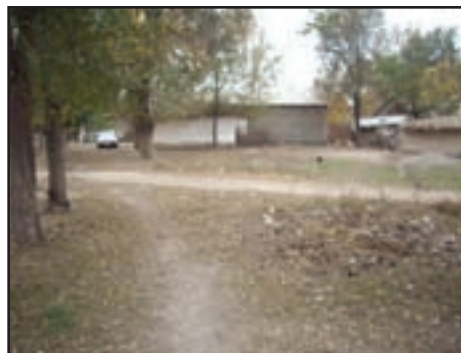
Building and land being purchased by the USA Jamaat for a Mosque in Bishkek Kyrgyzstan