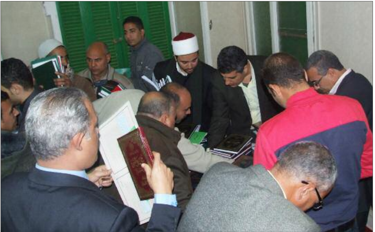
Conference attendees picking up free books