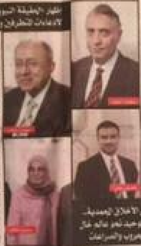
الشيخ «الوسطية» في نظرية الاعتدال الفكري والاعتدال الفكري

في مواجهة ساخنة مع مسئولي الجمعية الإسلامية الاحمدية الافريقية بالبريك