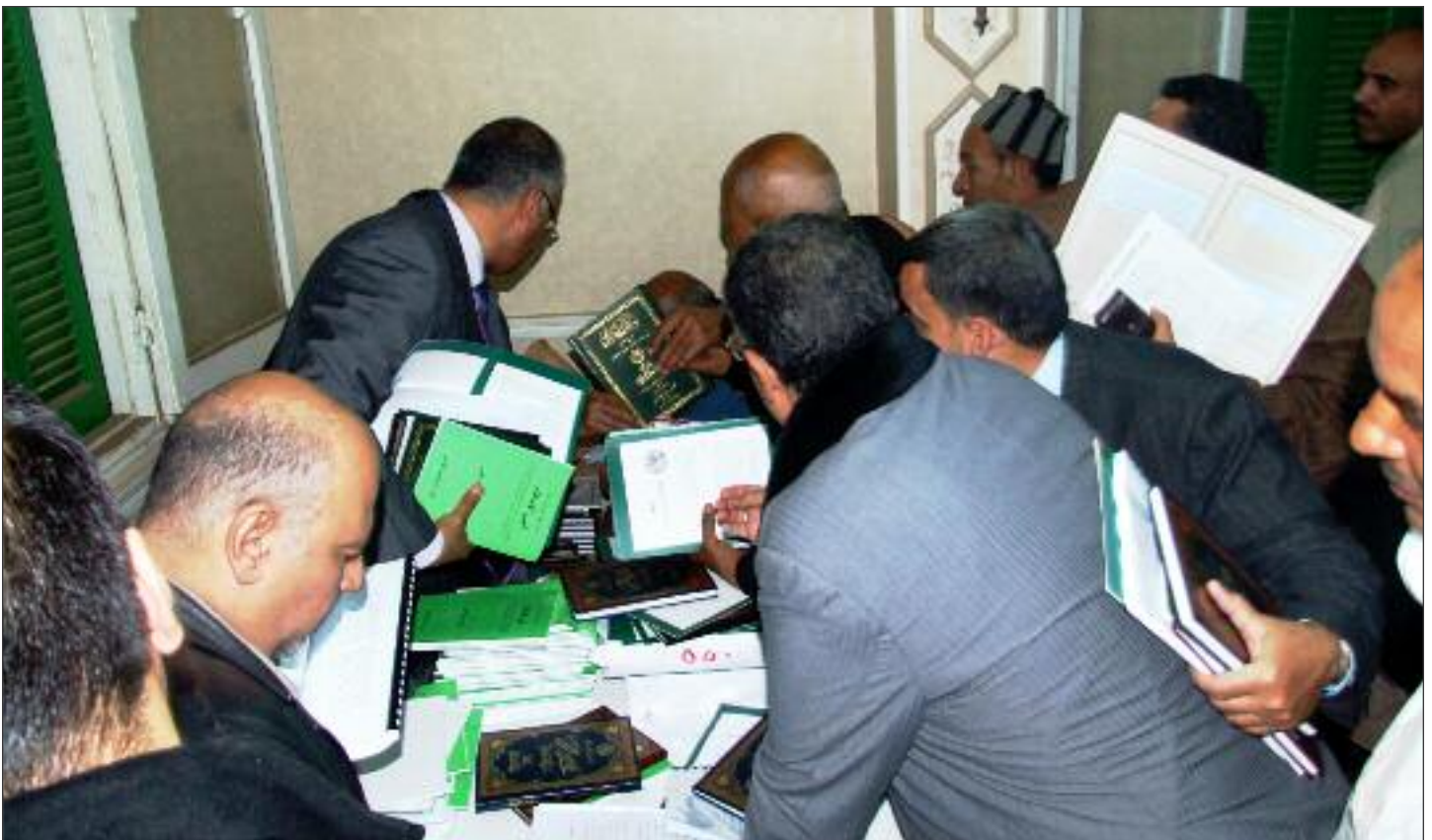
Conference attendees picking up free books